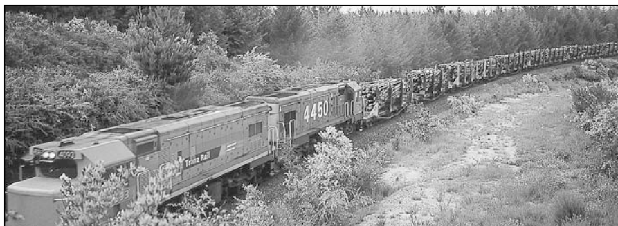
Fletcher Challenge Forests